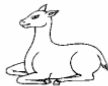
Deer The deer - usually in pairs - symbolises the first sermon of the Buddha which was held in the deer park of Benares.