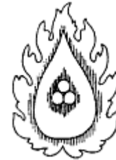
Tiratana The three jewels - the Buddha, the Dhamma, and the Sangha.