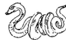
Naga The snake king. Vestige of pre-Buddhist fertility rituals and protector of the Buddha and the Dhamma.