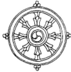
Dharmachakra The wheel of the law. The eight spokes represent the eightfold path.