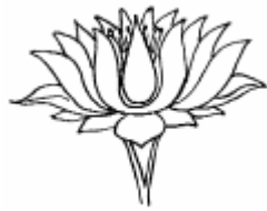
Lotus Flower Padma - Symbol of Purity. Can be of any colour except blue.

Since the making of human images of the Buddha was considered sacrilegious for a long time, Buddhist visual art has produced an elaborate vocabulary of symbolic and iconic forms of expressions. A great variety of Buddhist symbols is found in temples and in Buddhist visual art and literature. The following eight figures are among the more common ones. The lotus, the wheel, and the stupa can be seen in almost every Buddhist temple. One may understand these symbols as visual mantras. Contemplating these figures is an exercise in meditation to establish inner contact with the aspect that is represented.